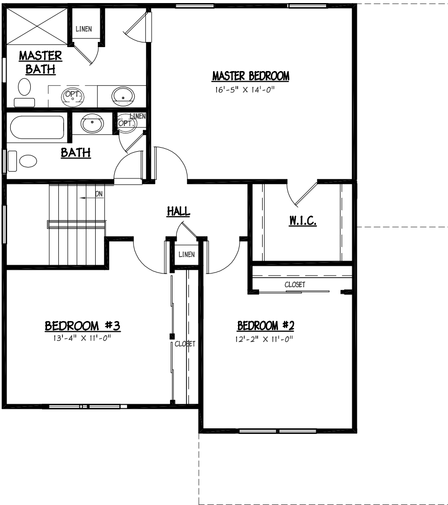
SECOND FLOOR PLAN LIVING AREA 922 SQ. FT.