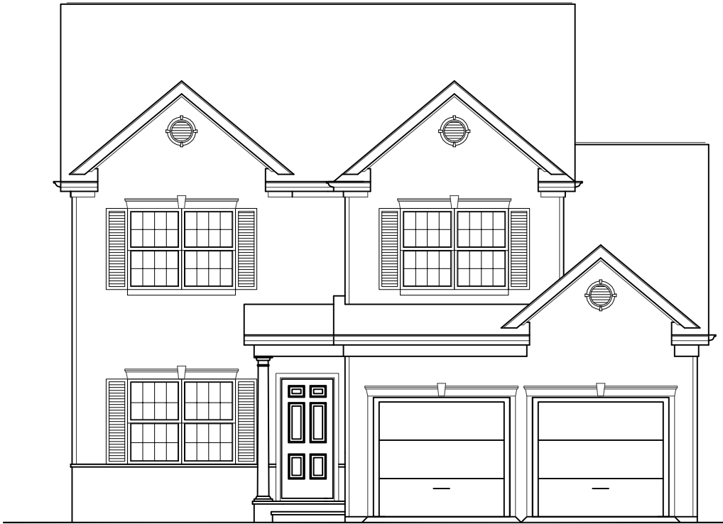
FRONT ELEVATION "A"