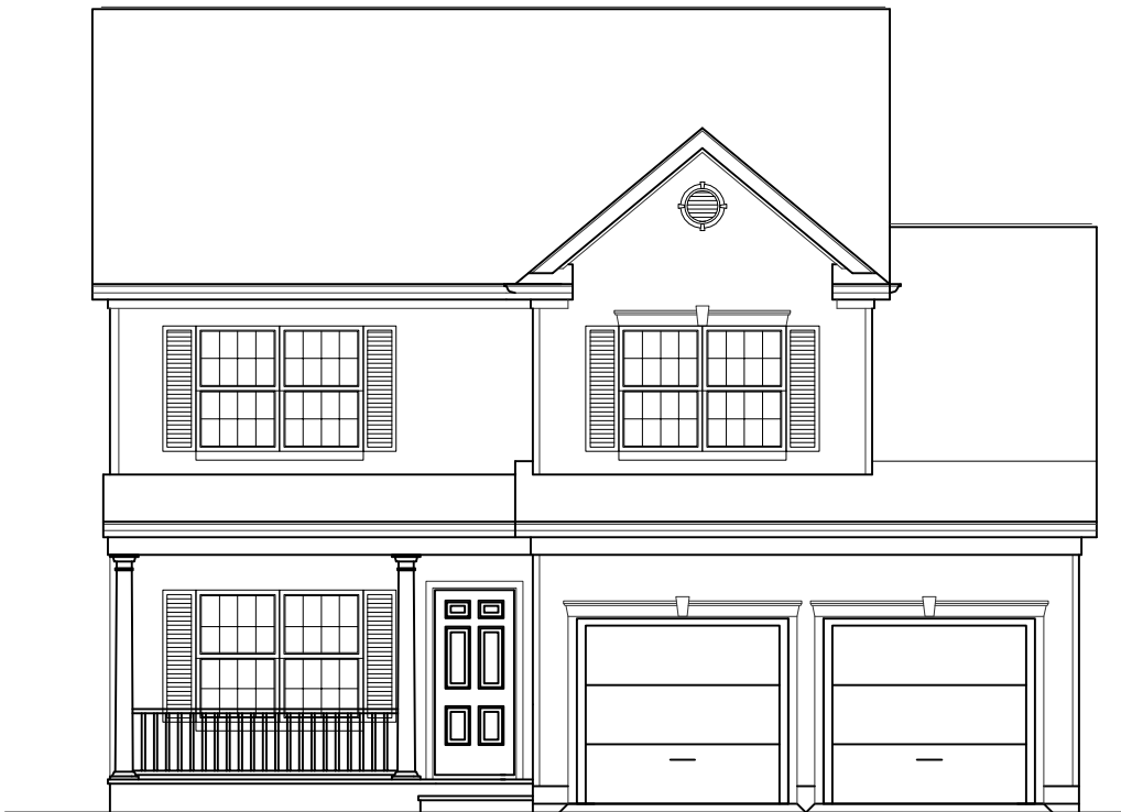
FRONT ELEVATION "B"