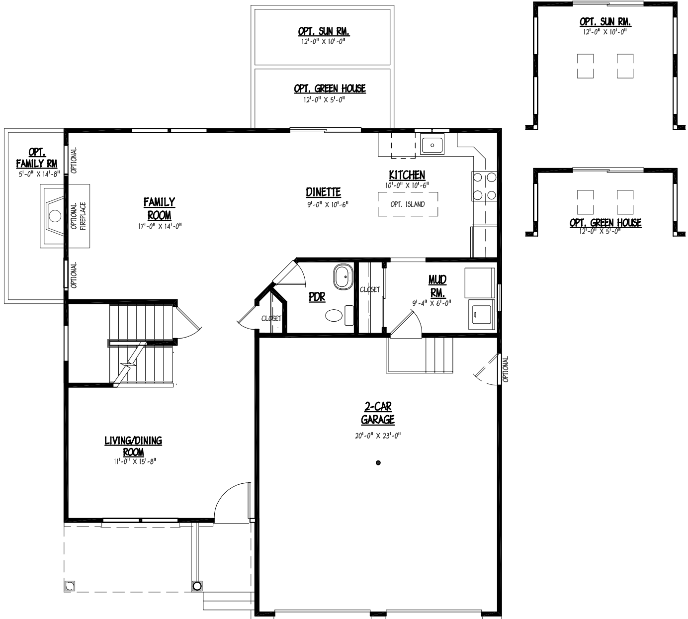
FIRST FLOOR PLAN LIVING AREA = 895 SQ.FT.

FINISHED HOUSES MAY VARY FROM ARTIST RENDERING. BUILDER RESERVES THE RIGHT TO MAKE CHANGES AS DEEMED NECESSARY. ALL ELEVATION, FLOOR PLAN DIMENSIONS AND DETAILS SHOWN HERE ARE APPROXIMATE AND SUBJECT TO CHANGE WITHOUT NOTICE. WINDOW AND DOOR LOCATIONS MAY VARY ACCORDING TO ELEVATION.